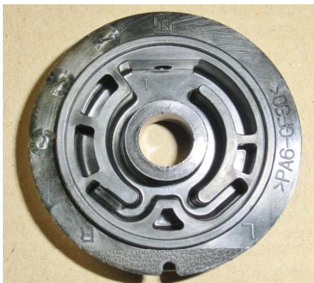
Reel P/N: 848E4075C0